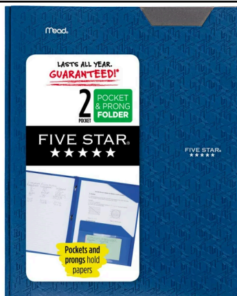
Heavy duty, plastic, 3 pronged folder, any color