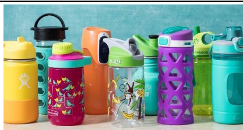
Any DISHWASHER safe, unbreakable water bottle