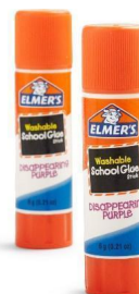
Elmer's Brand Glue