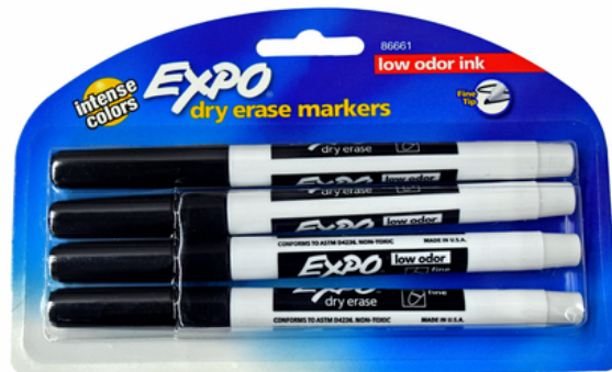
Expo, black, fine point dry erase markers